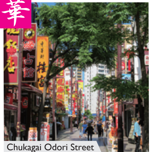
Chukagai Odori Street